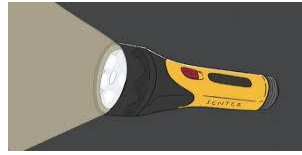
Figure 1.1 Straight propagating light

Straight propagation will occur if it passes through an intermediate medium. A simple example is when you turn the flashlight forward, the light will travel straight in the desired direction. To prove that light travels in a straight line, it can be seen from sunlight entering through gaps or through the windows of our house. And if the lights are on a motorized vehicle at night, the light from the motorized vehicle's lights travels in a straight line. There are many events that occur in life that can prove that light has the property of being able to travel in a straight line.