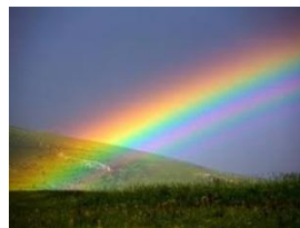
Figure 1.5 Light Can Decompose

Light decomposition or light dispersion occurs naturally. An example is when a rainbow occurs. The colors in the rainbow come from just one color, namely the white color of the sun. However, the white color is refracted by raindrops, resulting in the white light being broken down into several colors so that beautiful colors are formed. In a narrow area, light experiences wave bending, namely the occurrence or events of bending the direction of propagation of light waves because they pass through a narrow gap. or is the decomposition of white light into light that has various colors. This event is proof that light can be described.