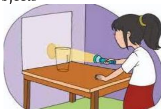
Figure 1.3 Light can penetrate clear objects

Clear objects are objects that can be penetrated by light. This is because clear objects are able to transmit light. Like clear glass that can be penetrated by light, this event can prove the nature of light that can penetrate clear objects. But if light hits a dark object, the light will not penetrate but will form a shadow. Also with clear glass, sunlight can still enter the room, even though there are obstacles because the windows are made of clear glass. An example is when we look at a window with clear glass, light will still come in.