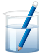
Figure 1.4 Light can be refracted

Refraction is the event of a bend in the direction of propagation of light when it passes through a different propagation medium. Refraction is the process of bending the direction of propagation of light when it passes through two media of different densities. This refraction of light by humans is utilized in various optical devices. For example, when we swim and put a stick into the water exposed to sunlight. When viewed from above, the stick will look larger than its original size. pencil inserted into water in a glass.